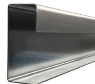
Sliding Door Hardware