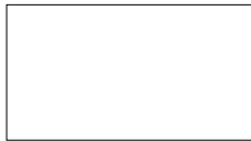
REGAL WHITE SRI: 78

PVDF (Polyvinylidene Fluoride) is a highly non-reactive and pure thermoplastic fluoropolymer used in a variety of applications where the highest purity, strength, and resistance to solvents, acids, bases, and heat are required. PVDF pre-painted steel is best suited for high-end applications such as commercial or residential roofing, pre-engineered buildings, architectural wall panels, facades, and other applications where durability and long-lasting performance are required.