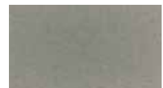
WEATHERED ZINC SRI: 40