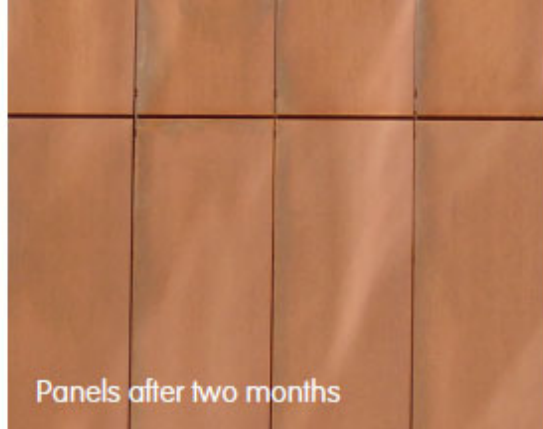
Panels after two months