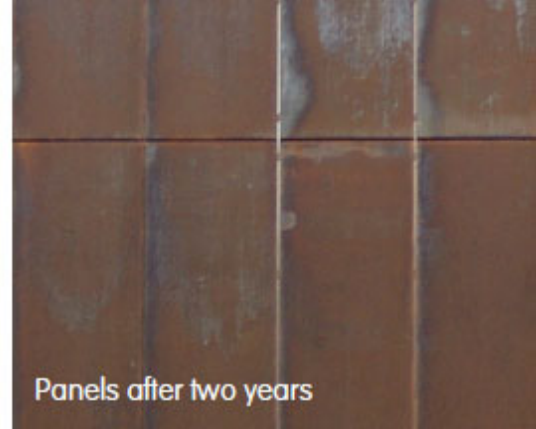
Panels after two years